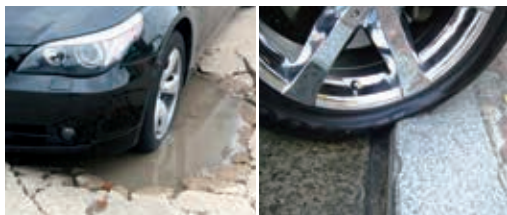
Impact damage such as curb / pothole