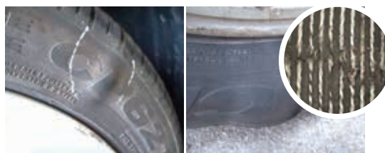
Localized protrusion in the sidewall